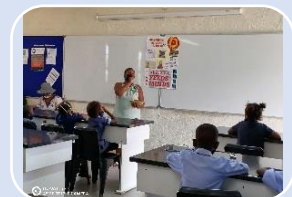
World Read Aloud Day