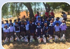
Beyond Adventure Food Parcels