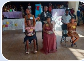
Miss Freshet & Mr Fresher