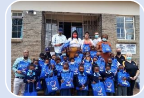
Beyond adventure stationary donation.