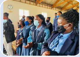
Thanks giving service.