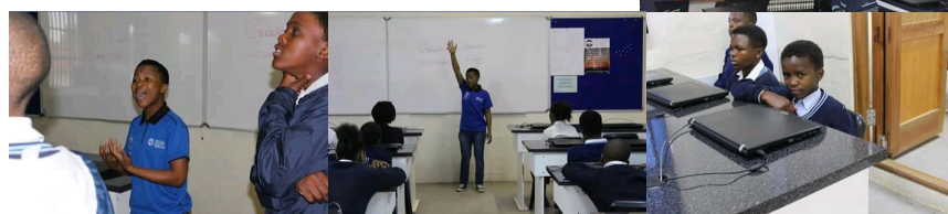
Sifunda kunye Training