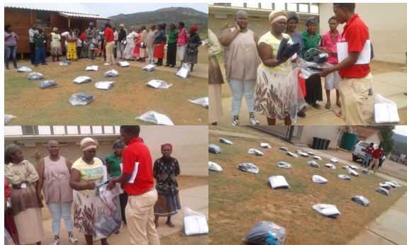
Sassa's uniform handing over