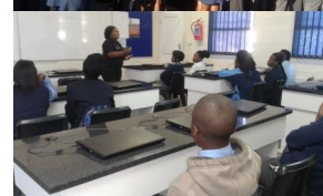
Ex learner's visit